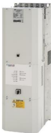
MaxSine™ Compact module

Alstom reactive power compensation equipment helps customers improve performance with energy savings and better power quality. Our products and solutions save customers money and reduce the environmental impact of their operations.